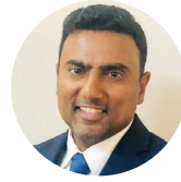
Ravikumar Nematikanti NCR Corporation CTO, Digital Banking