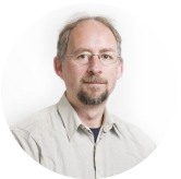
Adam Back Blockstream Co-Founder