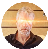
Michael Saylor MicroStrategy Chairman & CEO