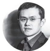
Changpeng Zhao Binance CEO